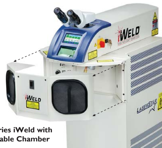
960 Series iWeld with Removable Chamber