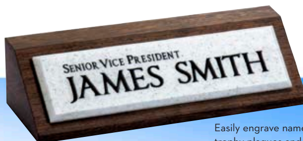
Easily engrave nameplates, trophy plaques and awards.